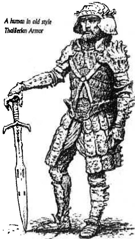
A human in old style Thallierian Armor

9. LARD ASS BRONTH. On a related note, have you ever taken a close look at the physical dimensions of a Bronth? They are listed in the "Sholari's Companion" as being, on average, 6'4" and 450 lbs. Compare that with a Corastin's 10' and 450 lbs, and I think you're looking at a hefty biped. Bronth are usually illustrated with Apollonian bodies, but they're probably more like Winnie the Pooh than Mr Universe. Shake your booty indeed.